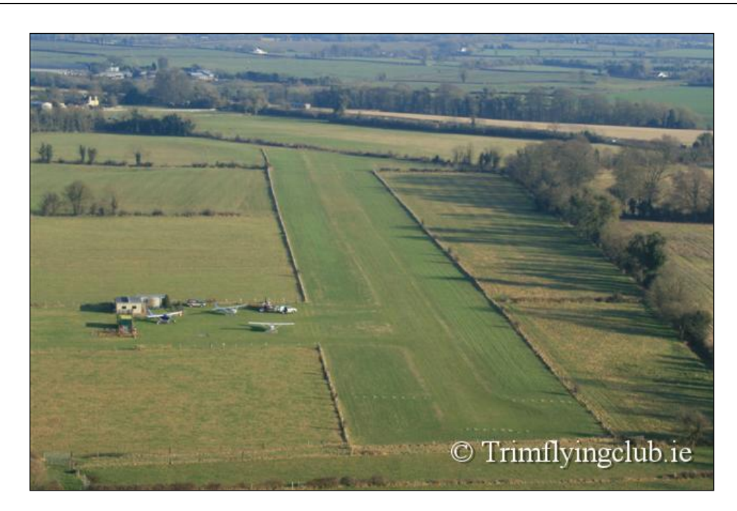
Figure 12.1: Trim Airfield Grass Runway

25 Pilots need to consider their aircraft's take-off performance when using the runways at Trim, wet or long grass will reduce take-off and landing performance. Pilots are encouraged to avoid overflying any settlements at low level. Pilots taking off on Runway 10 should avoid flying over the farm house on the far side of the river. Pilots taking off on Runway 28 must avoid flying over the house located behind the trees and to the left of the climb out from 28. Figure 12.2, www.trimflyingclub.ie, shows the desired circuit pattern for Runway 28, with the objective of avoiding flying into the area marked in red, which can happen on the climb-out or on the cross-wind leg.